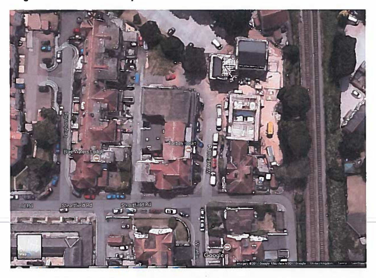
Figure 2 - Street view of Torbay Court Hotel on Warefield Road