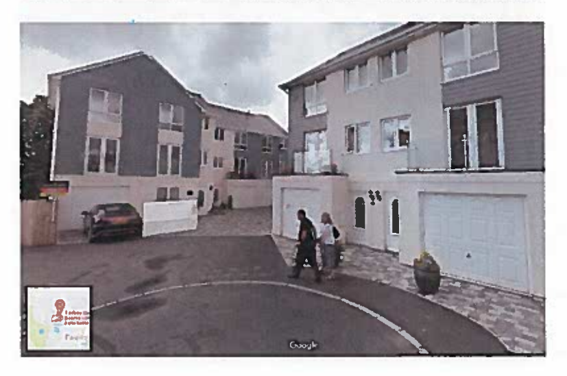
Figure 5 – Street view of Warefield Road showing Pier Sands Development