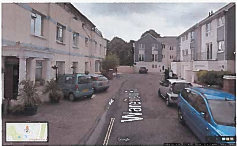
Figure 4 – Street view of Warefield Road showing Torbay Court Hotel on the left & properties on the right